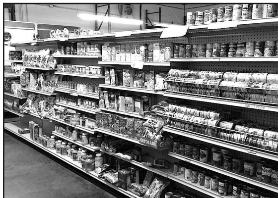
A stocked food aisle at Servant's Heart