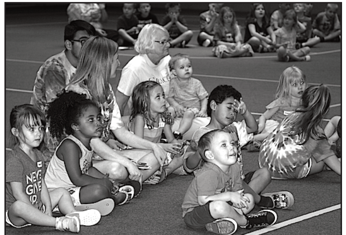
During Vacation Bible School the kids listened and watched intently to a puppet show depicting the Noah's Ark story.

With less than a year until the next VBS, we will begin planning soon for next summer. Please pray for us as we plan and prepare, for our volunteers, and ultimately that children and families will be touched by the Word of God and the love of our personal Savior.